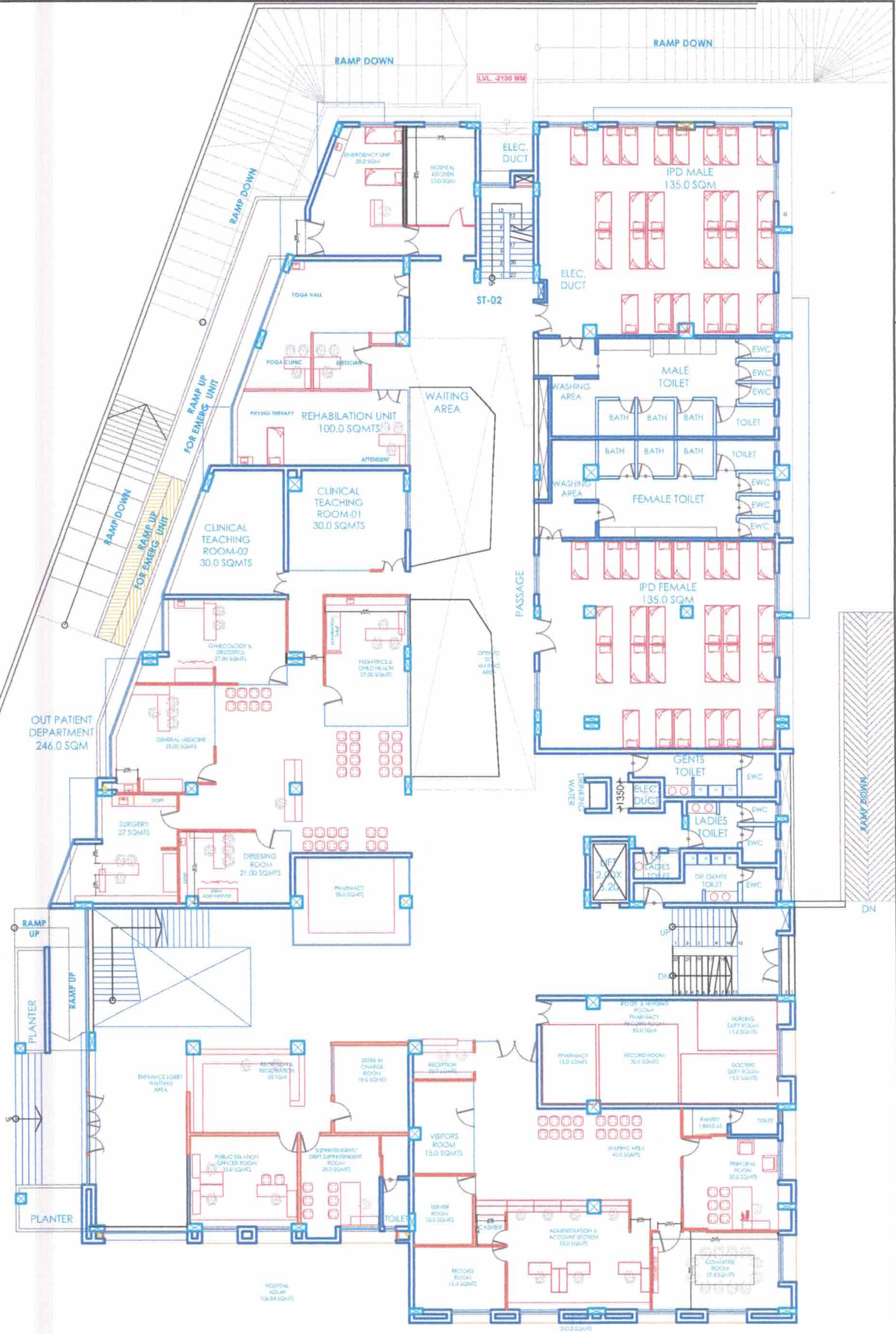
GROUND FLOOR_ FURNITURE ARRANGEMENTS